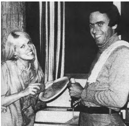
Serial killers are often known for their charming, ingratiating manner. Here, Ted Bundy charms a